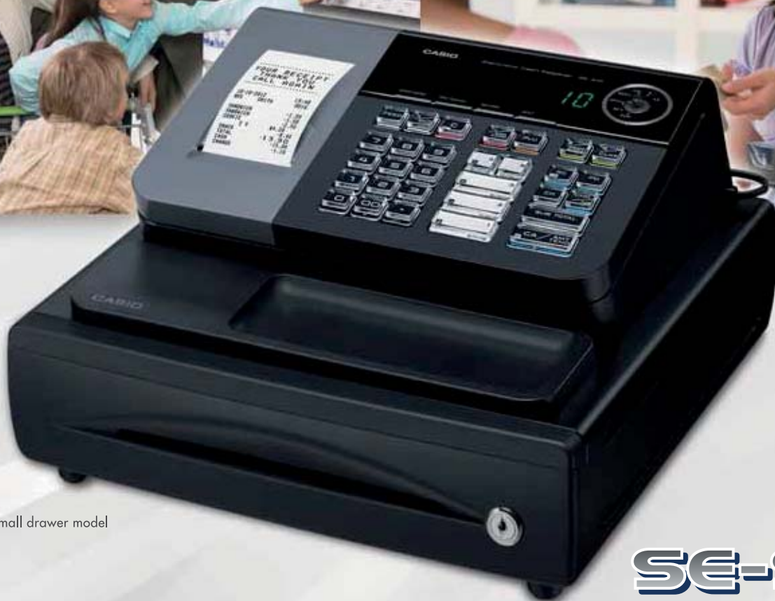
Small drawer model